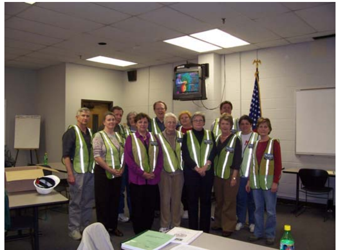
Graduates from CERT Training