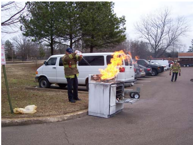
CERT Training Demonstration